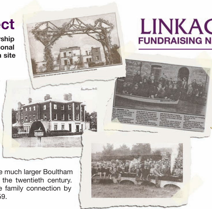
Vintage images of Boultham Park