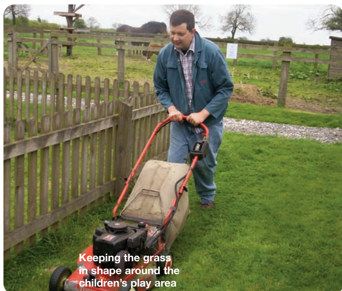
Keeping the grass in shape around the children's play area